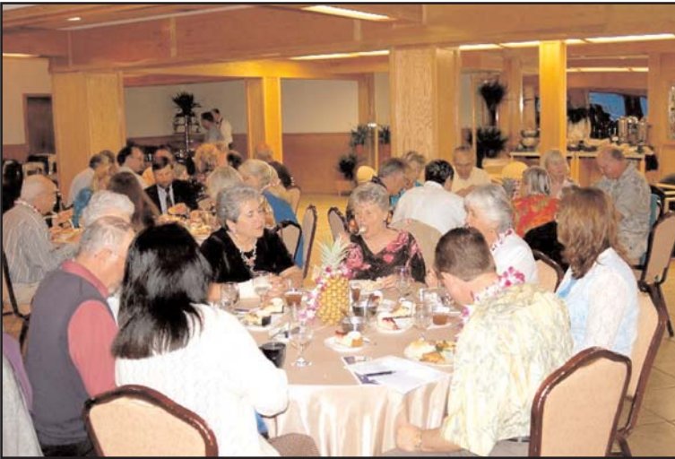
New and previous retirees and guests enjoying dinner at Marina Village Seaside Room.